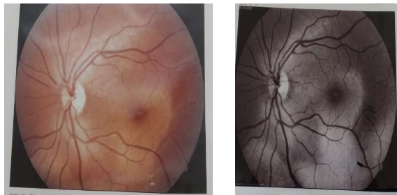
Figure 2: Fundus photograph showing retinal whitening and retinal discolouration

was 6/6 and there were no pigmentary changes on the macula. The corneal edema was also resolved.