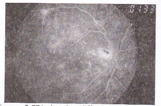
Figure -2 FFA showing diffuse macular edema