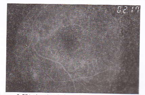
Figure -3 FFA showing ischaemic Maculopathy with IRMA