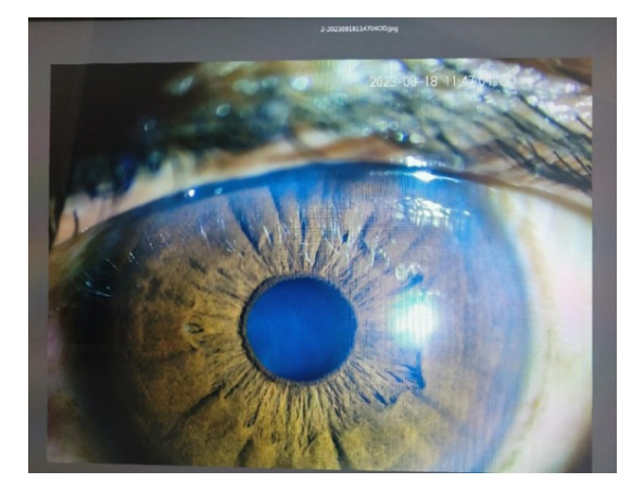
Figure 5: Slit lamp examination of anterior segment of left eye

To determine the nature of the mass and cause of pulsation, CT head and orbit were advised to the patient.