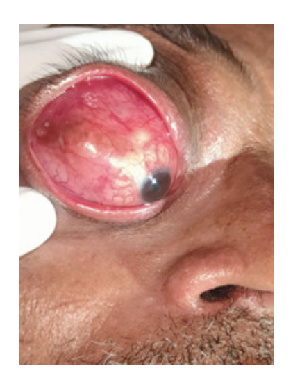
Figure 3: Herniating Right orbital content with the right globe deviated down

Figure 2: Lateral view of the patient representing overhanging mass