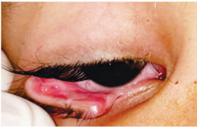
Figure 1: Preoperative image depicting a laceration of the right lower eyelid, characterized by a full-thickness tear of the lower canaliculus. The lower punctum is evident and is positioned abnormally, deviating from its typical anatomical location

accompanied by complete tearing of the right lower canaliculus (Figure 1). The punctal opening remained intact but was displaced from its normal anatomical position. The alignment of the lid margin was otherwise preserved, with no evidence of medial canthal tendon avulsion. The best-corrected visual acuity for the right eye was 6/6. A dye disappearance test revealed a delay on the right side, and irrigation through the upper punctum resulted in reflux from the lacerated lower canaliculus. The orbital margin was intact, and extraocular movements were full in all gazes. There were no signs of globe injury or naso-orbital fracture, and the examination of the left eye was within normal limits. After a comprehensive history and examination, written informed consent was obtained, and primary repair was successfully performed under general anesthesia within 12 hours of the